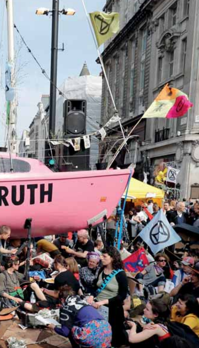
Left: Extinction Rebellion protesters in central London this summer; below: Greta Thunberg