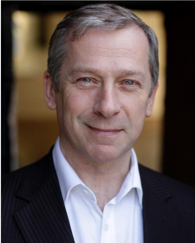
Paul Ryan Improve on You